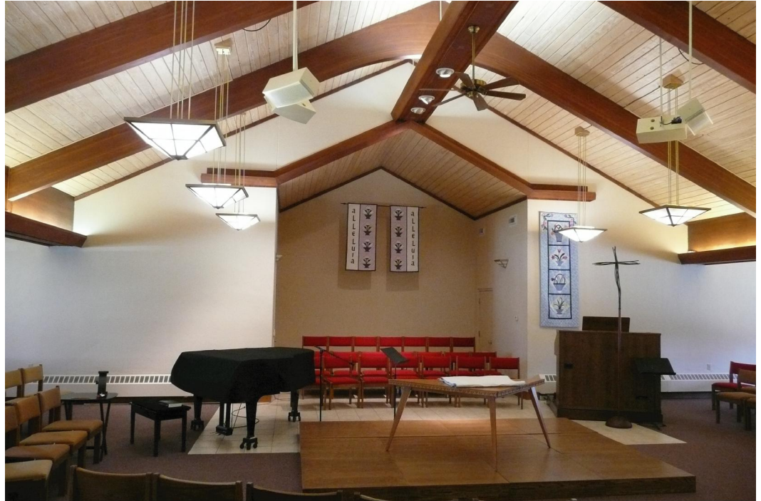
VIEW OF EXISTING WORSHIP HALL