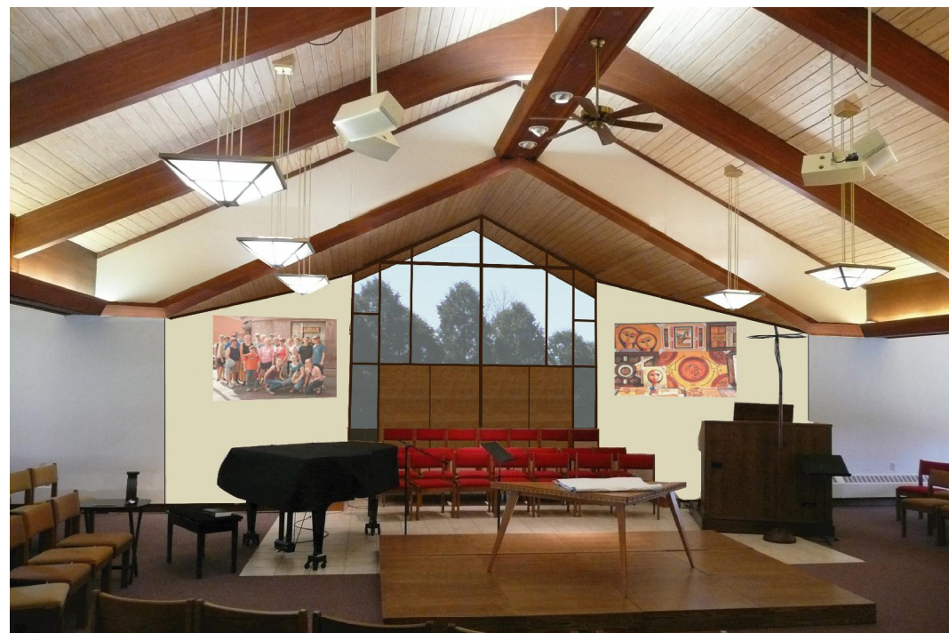
VIEW OF PROPOSED WORSHIP HALL