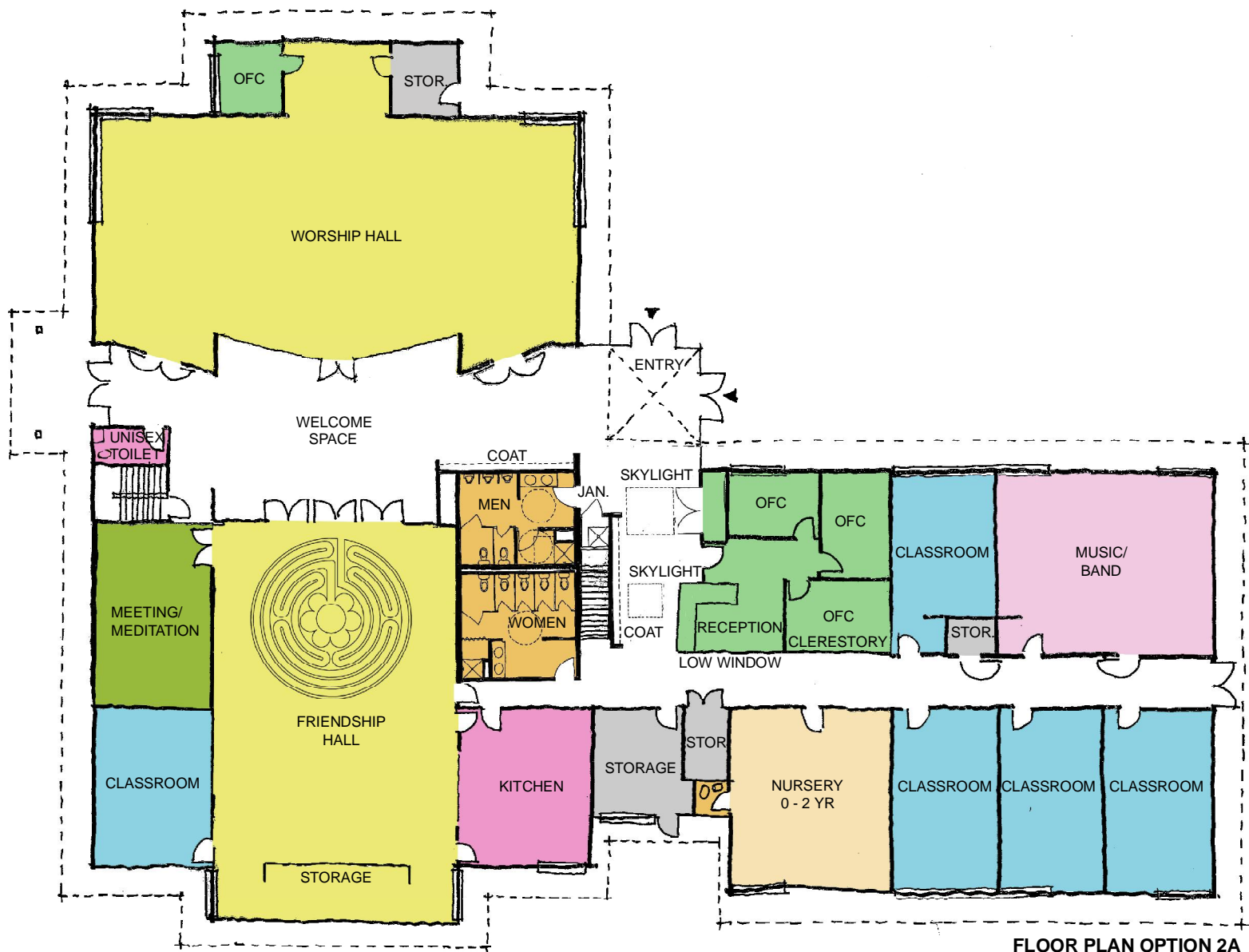
FLOOR PLAN OPTION 2A